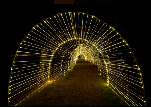
Middle Smithfield Tree Lighting Shoot Out