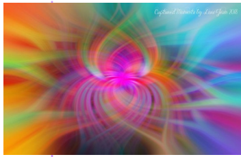
Table top photography by Lori Jean Hunny