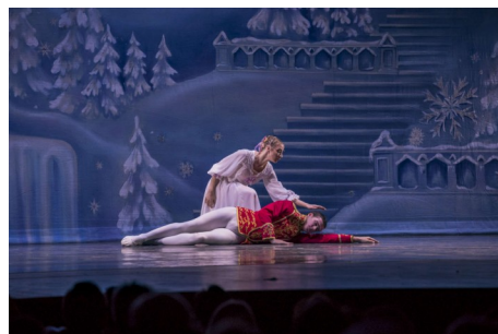
The Moscow Ballet by Ron Wyatt