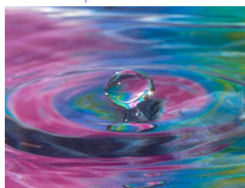
Water Drop by Dave Trainer From last month's table top meeting.

The parameters are as follows: There are eight topics this year. All photos must be taken between March 15, 2018 and May 24, 2018. You do not have to complete all 8 topics. You may enter as many topics as you like but only one photo per topic. Images must be submitted in JPEG ONLY . Only minor post-processing is allowed using exposure, saturation, contrast, etc.