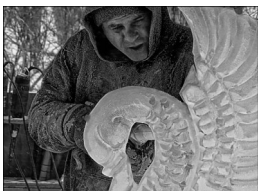
Ice Sculptor at Crystal Cabin Fever

Coming in March- Religious Architecture- March 24, 2018, location and time TBD.